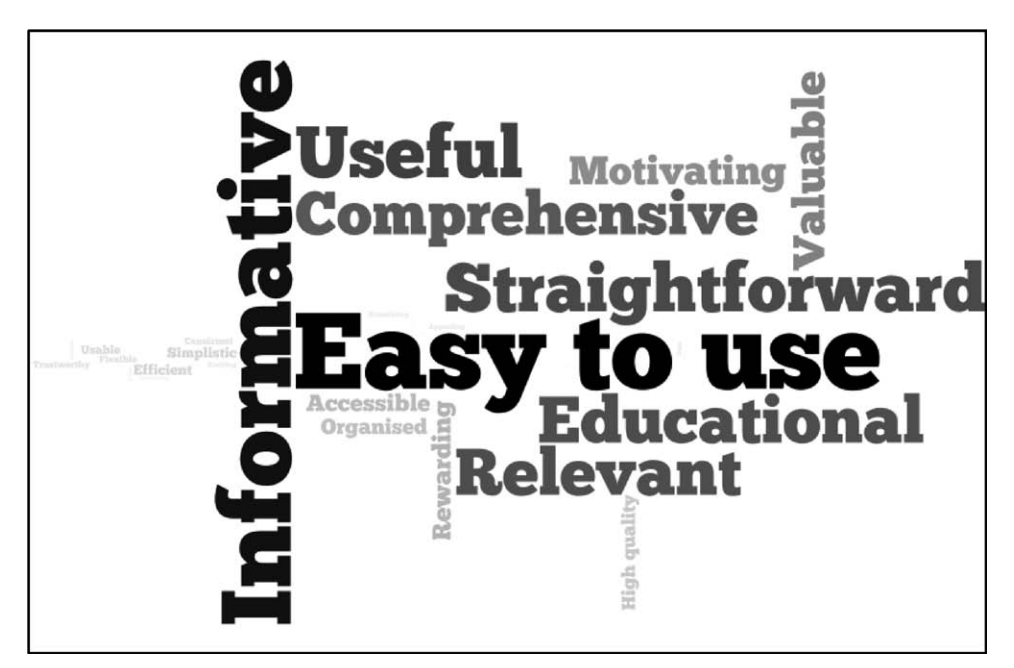
Fig. 3. Wordcloud to show the top five words to describe the reusable learning objects. The larger the font size, the more frequently the word was selected.

population. However, compared with those who presented for hearing assessment, our recruited sample were younger, had better hearing, and there were fewer women. It is likely that these significant differences resulted from the study eligibility criteria. For example, despite our best efforts to maximise accessibility to the RLOs, the main reason for nonparticipation was because a large number of patients, around one-fifth, could not access the RLOs as they did not have access to a DVD player, PC, or internet. Although we expected PC and internet use to be low (Henshaw et al. 2012), lack of access to DVD was poorer than expected given the percentage of households in the UK with DVDs in 2012 was 87% (Statista 2015).